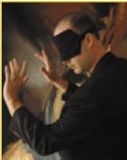
“Predicting Your Future.”