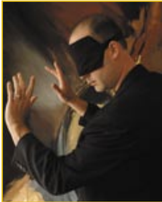
"Predicting YOUR Future."