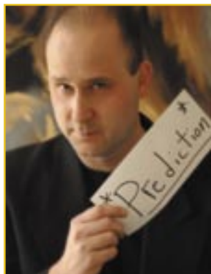
"Sealed Prediction Of What You Will Be Wearing On Show Night."

YOU PAY NOTHING... if he can't predict what you will be wearing on the night of your show... GUARANTEED!