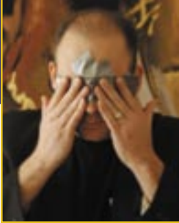
“The Man Can See Without His Eyes.”