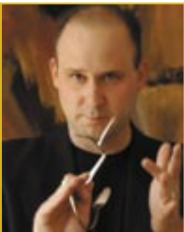
“Bending Spoons Before Your Eyes.”