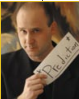
“Sealed Prediction Of What You Will Be Wearing On Show Night.”